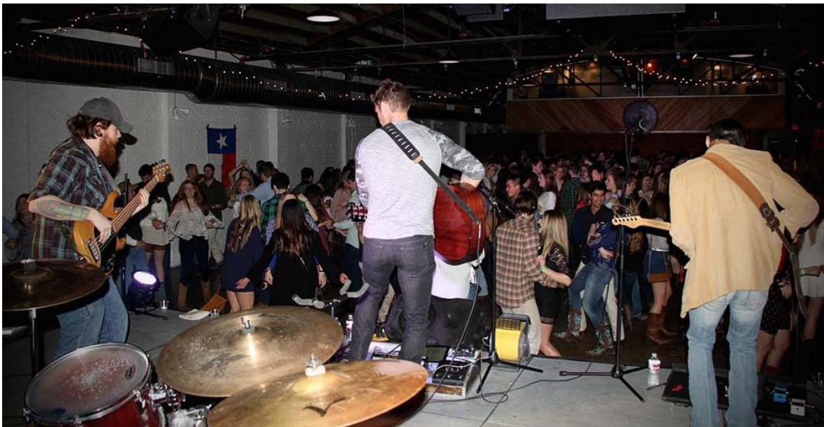
Two Step Throwdown, Fall 2015

Visit our Two Step website for more information on the event or to donate.