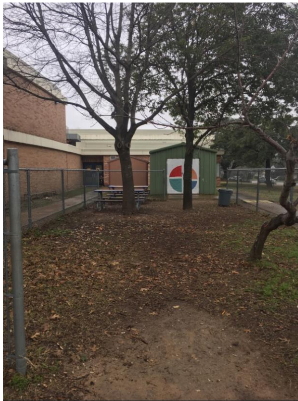
Location of Future Greenhouse